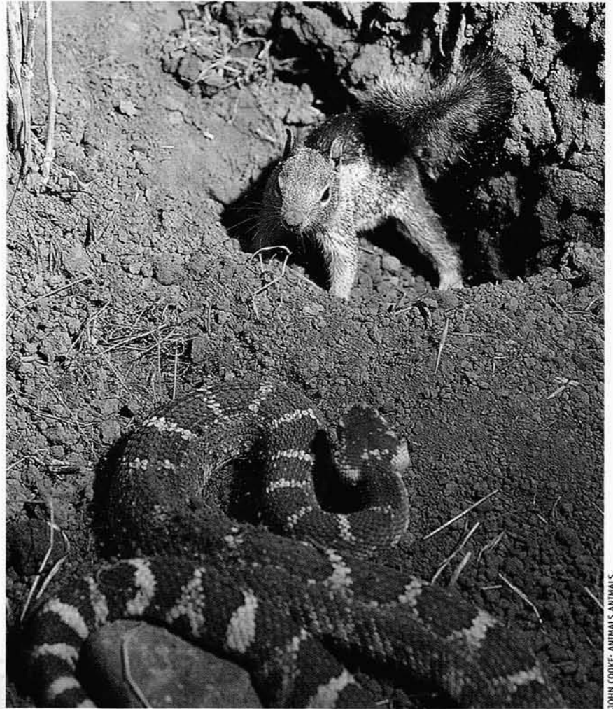
JOHN COOKE: ANIMALS ANIMALS

Made by injecting horses (or rabbits or sheep or goats) with small, sublethal doses of particular venoms, antivenom is a biological concoction of antibodies. It can combat only the specific venom that was injected into the animals, however. In the United States, the only rattlesnake antivenom now available is made from the serum of horses injected with the venoms of several kinds of pit vipers.