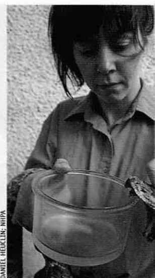
DANIEL HEICLING: NHPA

Of the fifteen species of rattlesnake found only in the United States, at least ten have been verified as having neurotoxins in their venom. Until recently, however, the low levels of these chemicals in the overall mix were not considered much of a threat to humans. The southern California case, along with a scattering of recent clinical reports from far-flung parts of the country, raises the possibility that the situation is changing. In 1998 in